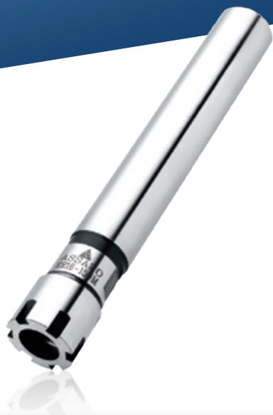
Dimensions / 尺寸標示