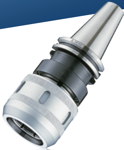
Dimensions / 尺寸標示