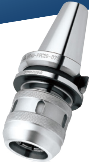
Dimensions / 尺寸標示