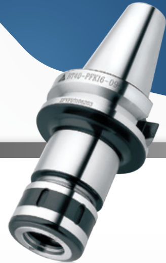
Dimensions / 尺寸標示