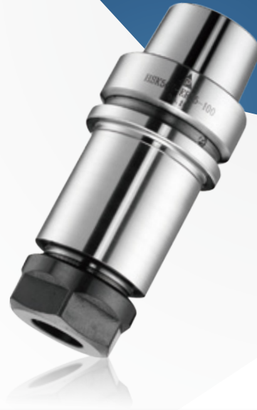
Dimensions / 尺寸標示