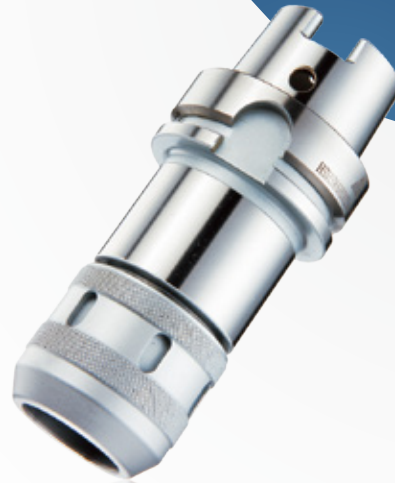
Dimensions / 尺寸標示