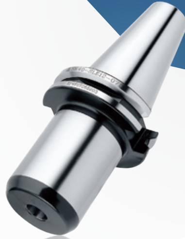
Dimensions / 尺寸標示